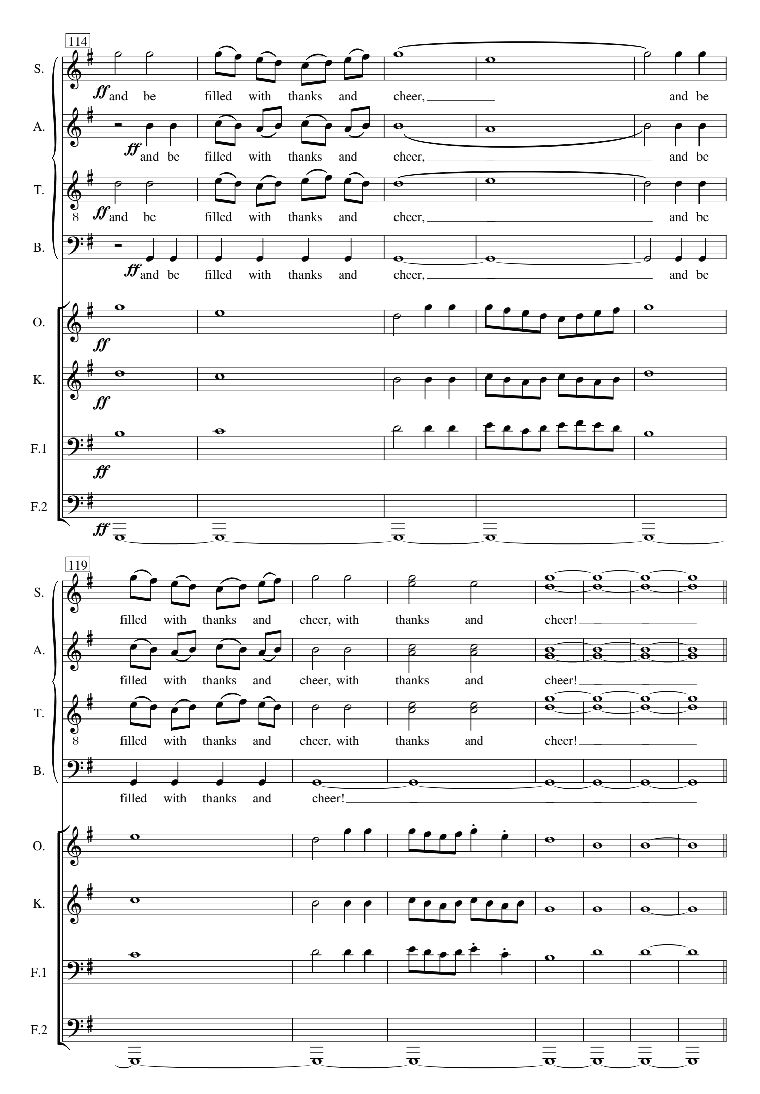
Stephan Herrmann - Opus 72 - Seite 13