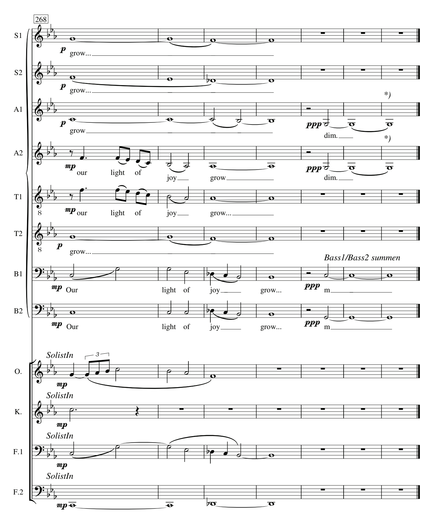
*) Alt 1/Alt 2: Bei der letzten ganzen Note auf das "m" von "dim" wechseln (also mit den Bässen zusammen summen)